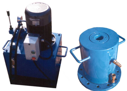
Hollowed extractor cylinder for cable stressing.